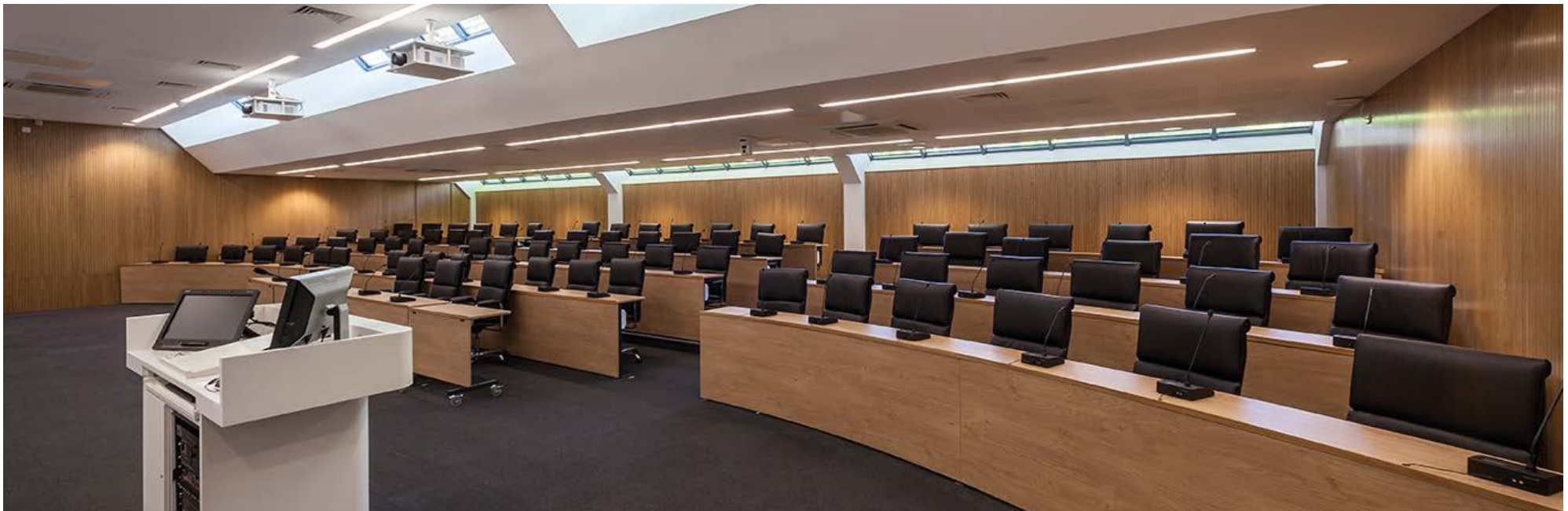
Sheffield University, Management School

To ensure all students have good sight lines and your chairs have a solid foundation, we will typically install our fixed tiering in curved rows surrounding the area of focus with writing ledges and full-depth modesty panels, with fixed or portable in each position. Discrete facing plates can be attached to the underside of these ledges to allow hidden trunking for fitted for power and data transfer.