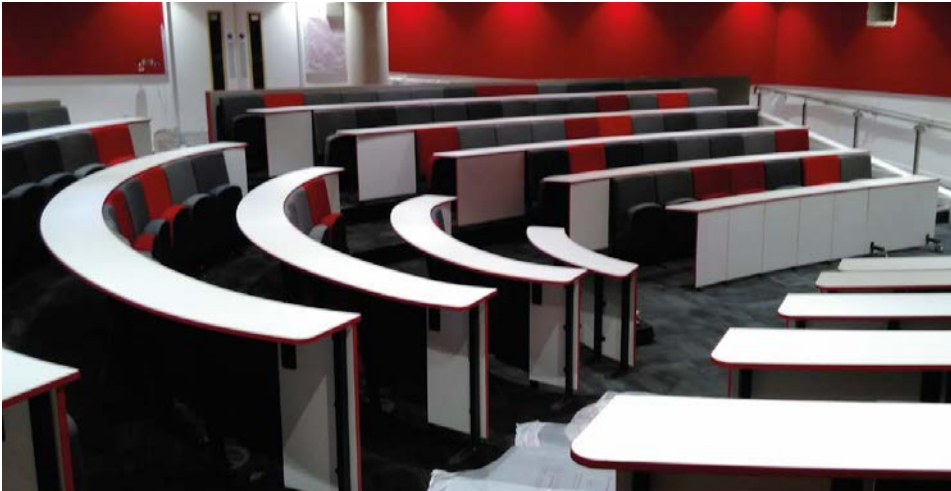
University of Southampton