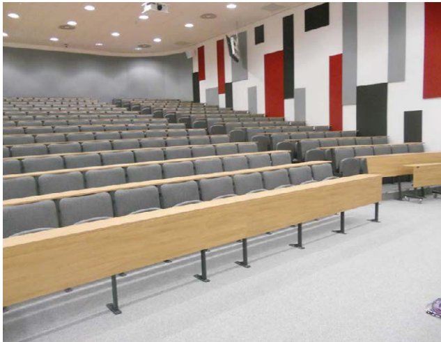
University of Glamorgan, Brecon Building